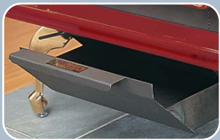
Ash disposal is clean and easy with a spring loaded removable ash drawer.