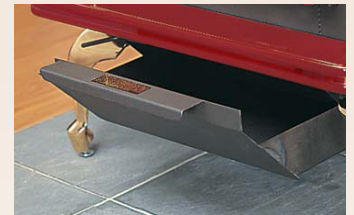
Ash disposal is clean and easy with a spring loaded removable ash drawer.

The Summit Classic Wood Stove, with patented Extended Burn Technology, has the power to keep you warm and comfortable throughout the night and the stamina to provide a bright, glowing fire with flaming logs to welcome you in the morning.