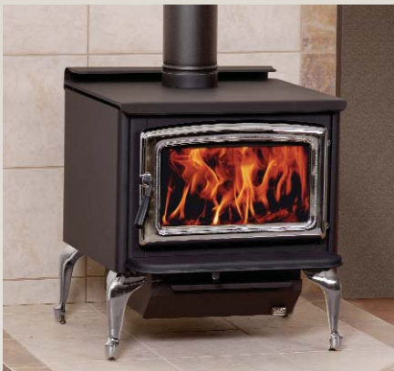
The Summit with Nickel Door and Legs.